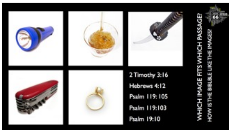
BIBLE MIX AND MATCH

If you have a Children’s slot or an all age part of the service use it to help the children grasp that the Bible is more than a book. There are some ideas on the slides marked ALL AGE.